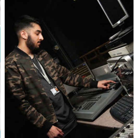
Advanced media and film