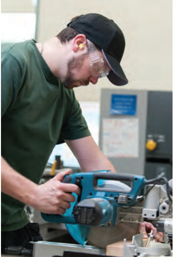
Queens Award winning construction training facilities for building, plastering, decorating and flooring