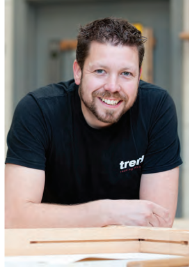
Our vocational training makes you job ready in your chosen field