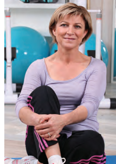
Excellent sports facilities