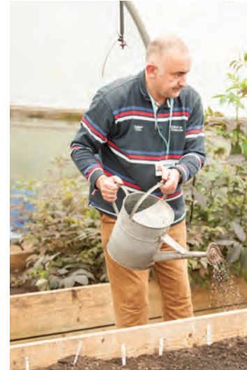
Practical experience of horticulture