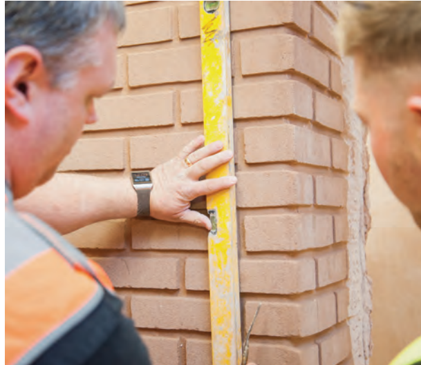
Practical experience of bricklaying