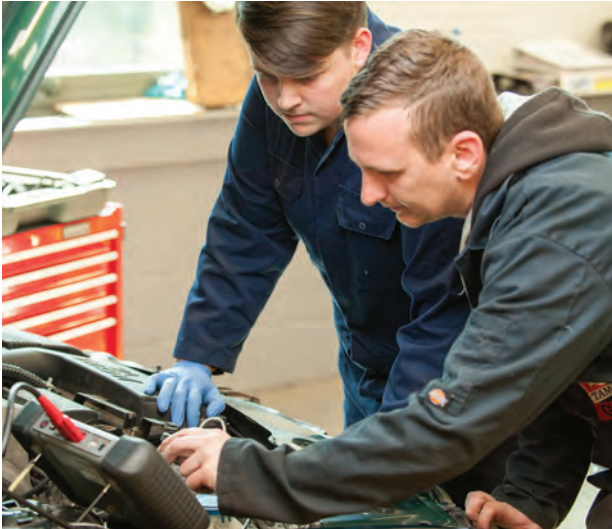
Advanced vehicle electronics with hands-on training on real projects