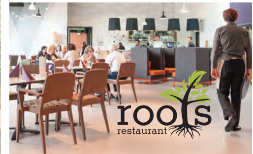
Our three training kitchens and one production kitchen were part of a £3 million investment and service the Roots restaurant which is open to the public